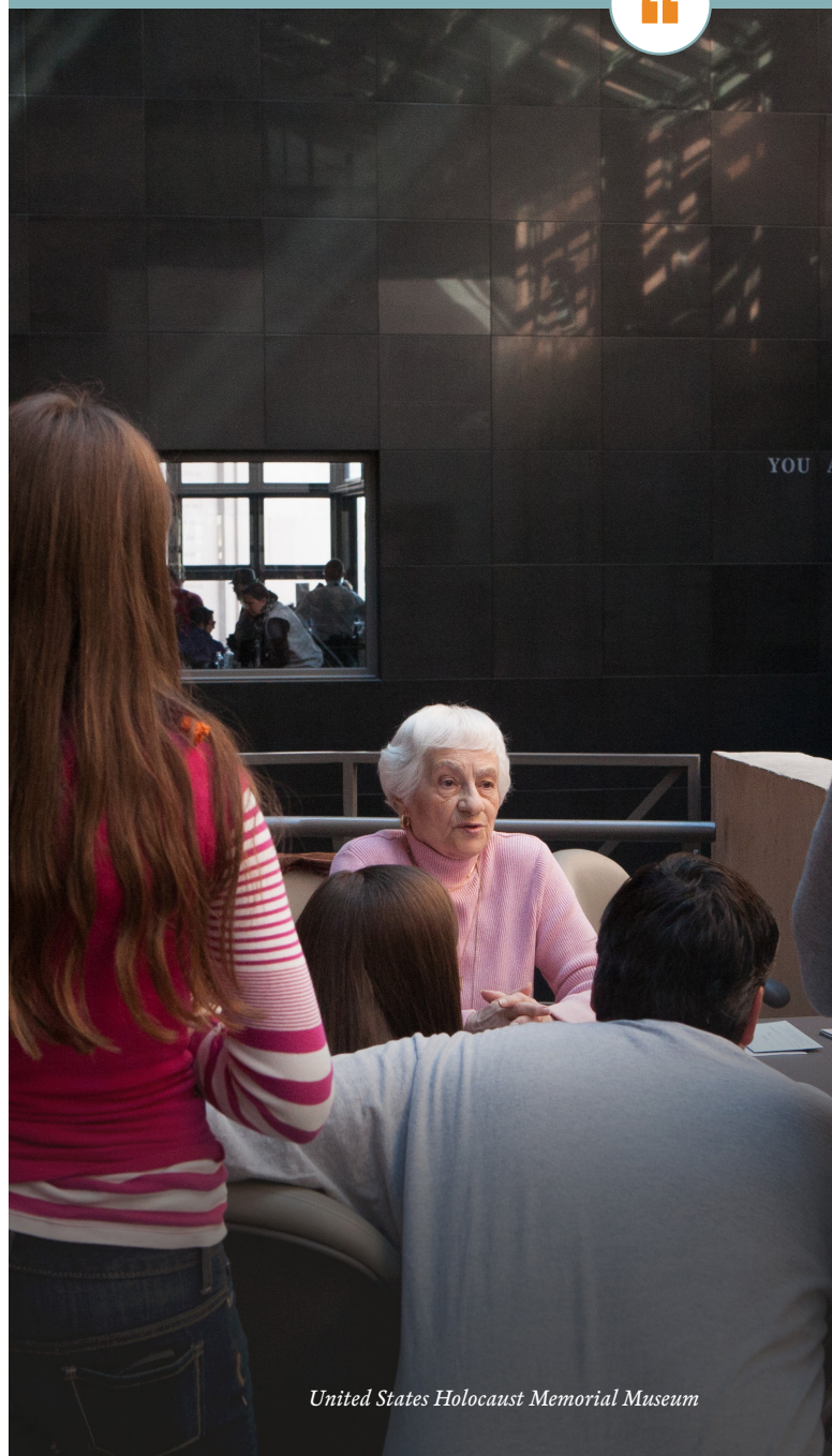
United States Holocaust Memorial Museum