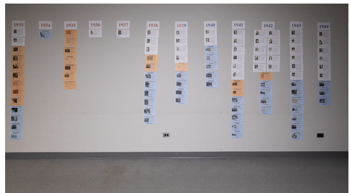
The Timeline Activity, United States Holocaust Memorial Museum